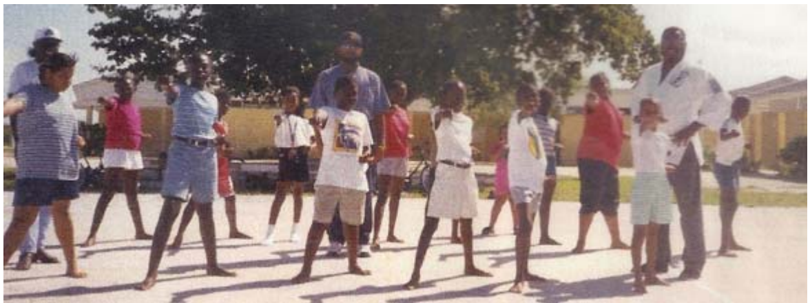
Wado Kai Karate Groups - Turks and Caicos Islands, British West Indies