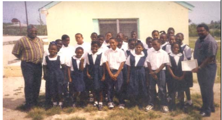
Wado training participants, local Primary School, Cockburn Town, San Salvador, Bahamas

Below: Open training session, community centre basketball court community Cockburn Town vicinity,