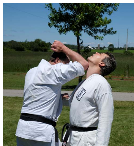
We're already looking forward to next year's Karate Camp !