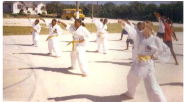
Long Island, North, High School Wado Kai Karate Group