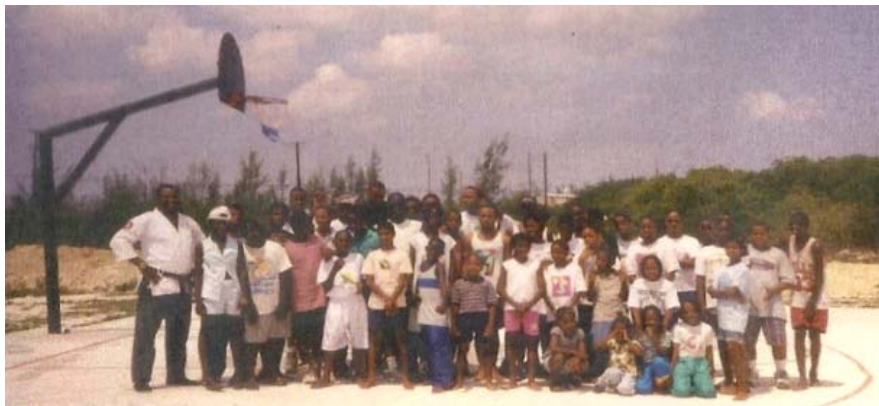
- students and members, and adjoining Bahamas

Below: Open training session, community centre basketball court community Cockburn Town vicinity,