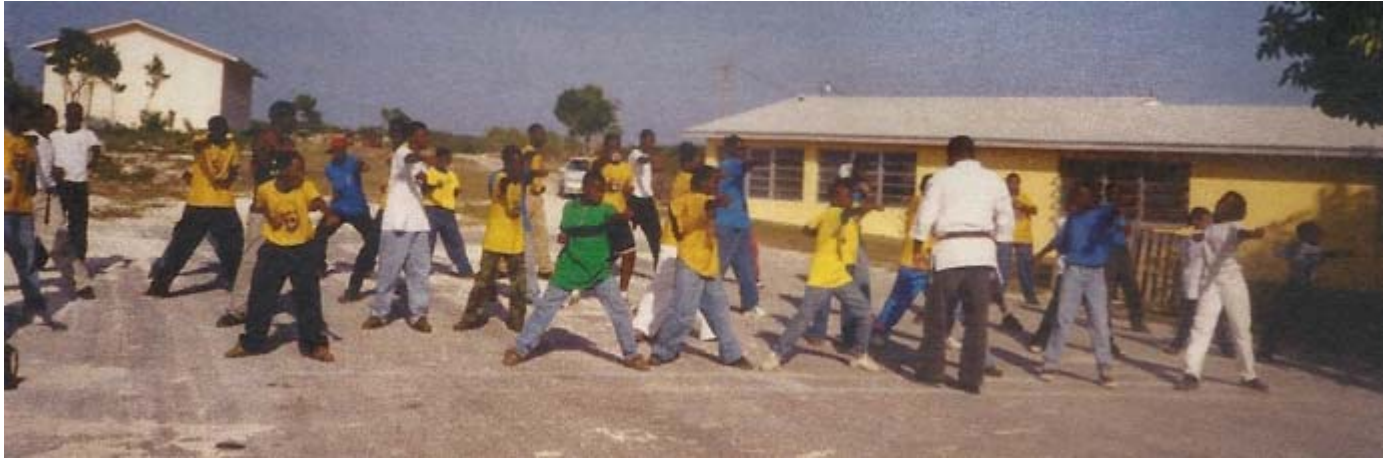
Inagua Island All Age School, Greater Inagua, Bahamas, Wado Kai Karate group