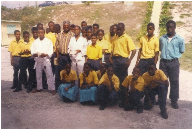
Students at Cockburn Town, San Salvador, Bahamas, High School participating in Wado training session