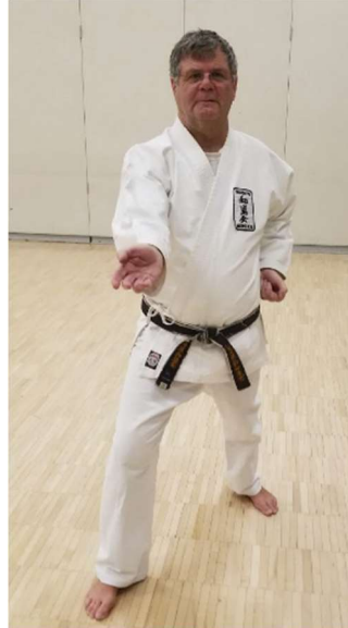
Attendees of the November 2023 Yudansha class at Thornhill Dojo: