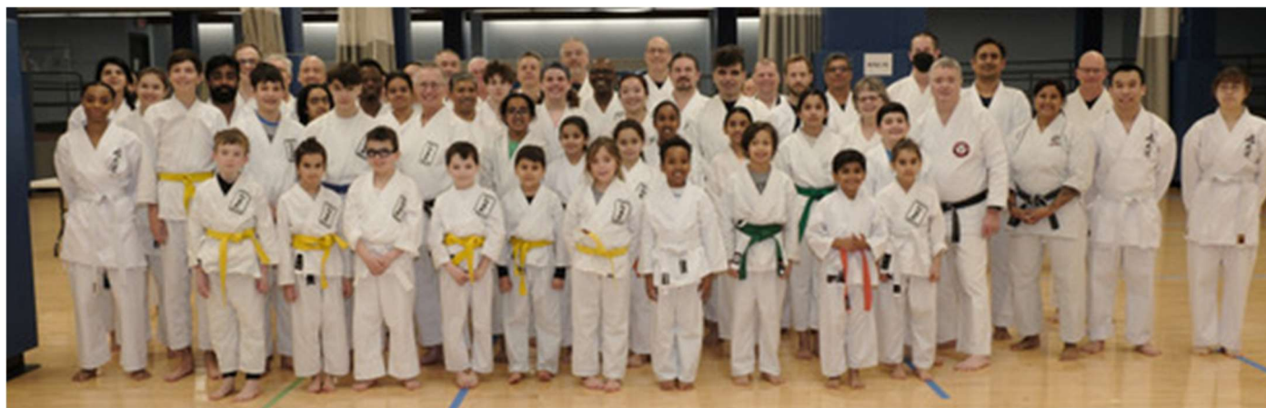
Participants of Spring Tournament

We always need judges. There is a section in the registration on-line for judges to register as well. Judges, please arrive at 1:30 for a Judges meeting prior to the tournament.