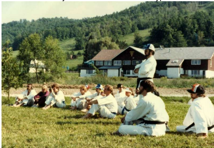
< At the Ryerson Chalet, Blue Mountain

I kept going back to classes when I could, and I attended the training camps at Rice Lake and the Ryerson Chalet at Blue Mountain, before the Wasaga Beach days. I went back to training with passion in 1982 and achieved my Shodan by early 1984. During this time, I started up the Port Perry club again, which had not been operating for many years.