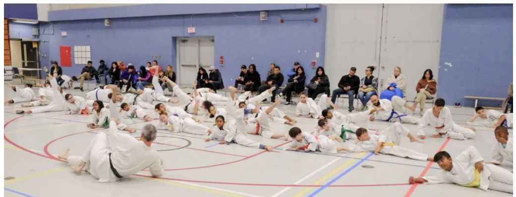
Students warming up at the October 2024 Tournament

As a Ryerson club alumnus, I have shared some of my memories of those early years of my training. I had to give you all something to read after all.